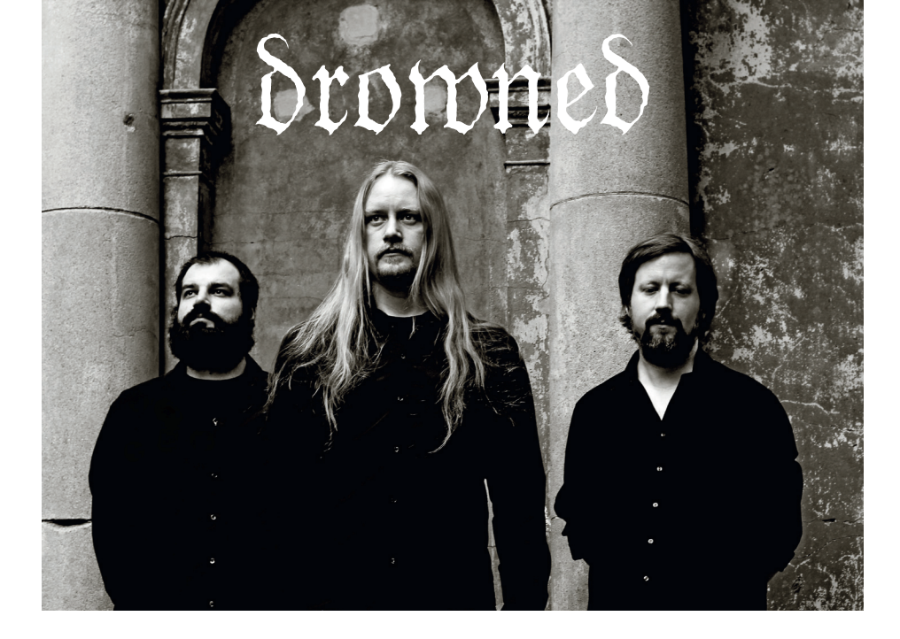
T2 { drums G { vocals, bass T1 { guitars